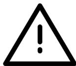
Danger To Life