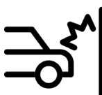
High Collision Risks