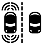
Stopped Vehicle Detection