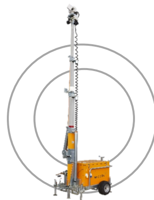
Network Rail Tower

The Network Rail Tower is a rapid deployment CCTV tower with PADS approval for trackside, level crossing, and rail depot surveillance applications.