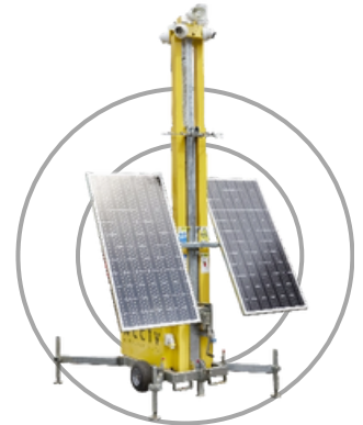
Thermal Solar Tower

An autonomous CCTV Tower designed to provide complete site security, where temporary monitoring is required on transient sites or compounds.