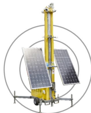
Thermal Solar Tower

The WCCTV Thermal Solar Tower is a solar-powered, thermal CCTV unit for early threat detection and easy redeployment.