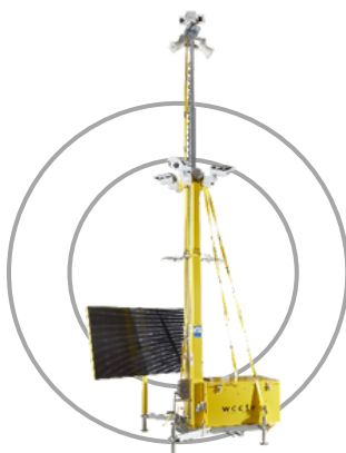
Solar Fuel Cell Tower

The WCCTV Solar Fuel Cell Tower is a self-powered CCTV unit for remote sites, running without mains power or generators.