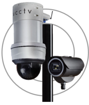
Dome with ANPR

WCCTV's CCTV systems can be equipped with ANPR technology to support vehicle monitoring, enforcement and access control.