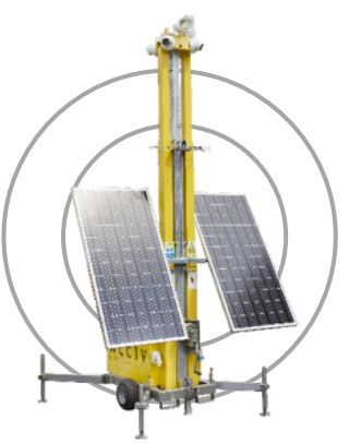
Thermal Solar Tower

The WCCTV Thermal Solar Tower is a solarpowered, thermal CCTV unit for early threat detection and easy redeployment.