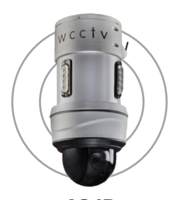
4G IR Mini Dome

The WCCTV 4G IR Mini Dome is designed for rapid deployment and discreet monitoring. It's ideal for housing teams, local authorities etc.