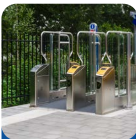
Turnstiles at entrances