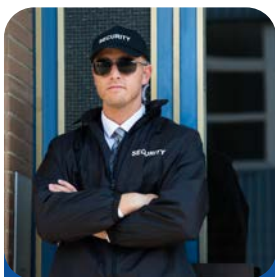
Increased security guards

Access control options you could implement are as follows: